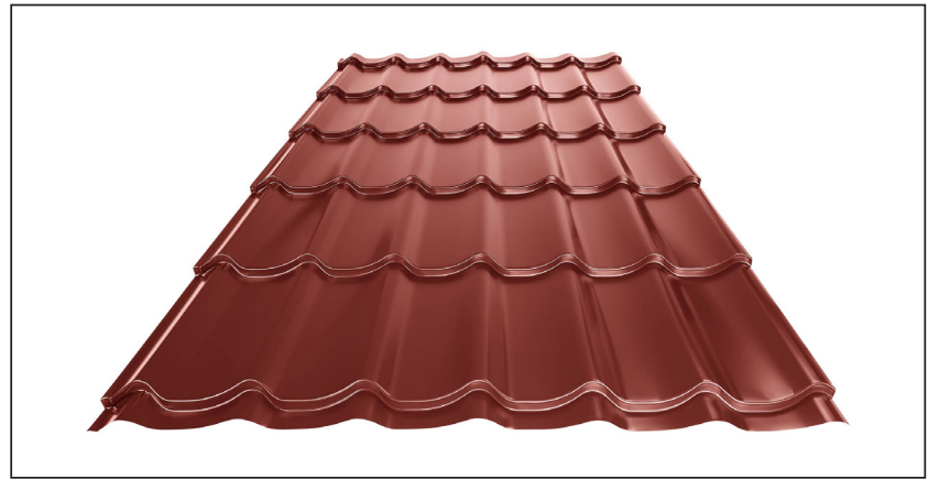
L – OPTIMAL LENGTH OF ROOFING FOR MODULE 350 mm