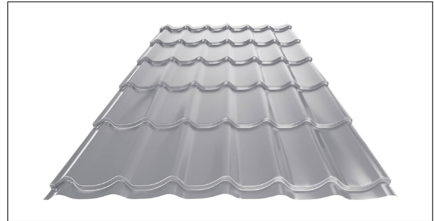
L – OPTIMAL LENGTH OF ROOFING FOR MODULE 350 mm