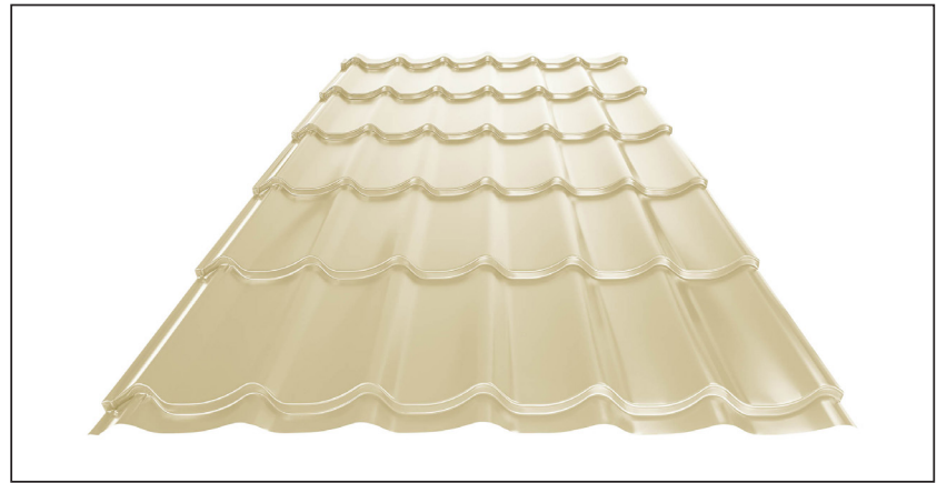
L – OPTIMAL LENGTH OF ROOFING FOR MODULE 350 mm