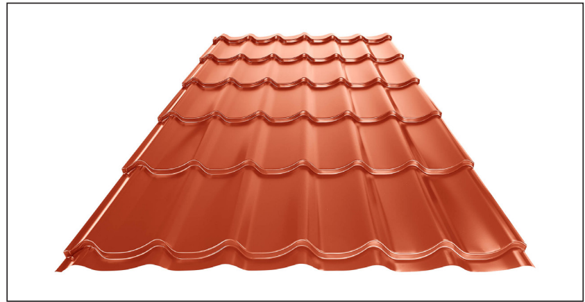
L – OPTIMAL LENGTH OF ROOFING FOR MODULE 350 mm