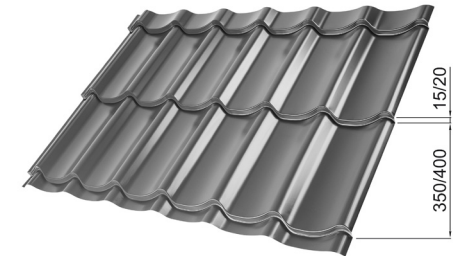
L – OPTIMAL LENGTH OF ROOFING FOR MODULE 350 mm