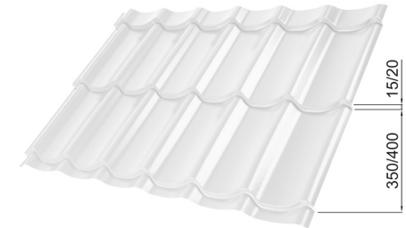
L – OPTIMAL LENGTH OF ROOFING FOR MODULE 350 mm