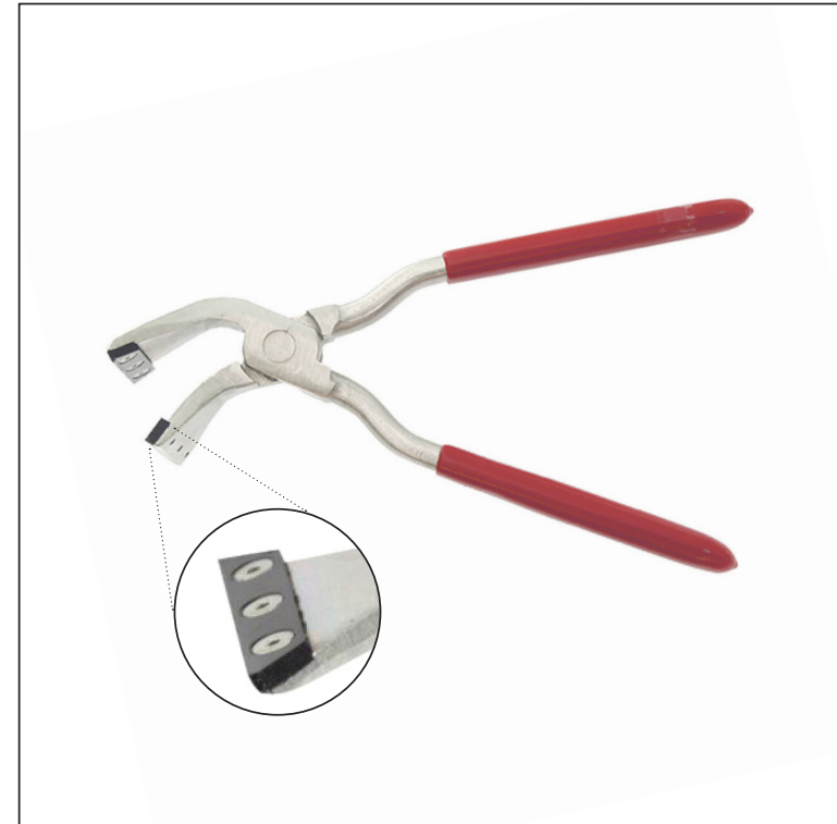
Carbon steel C45