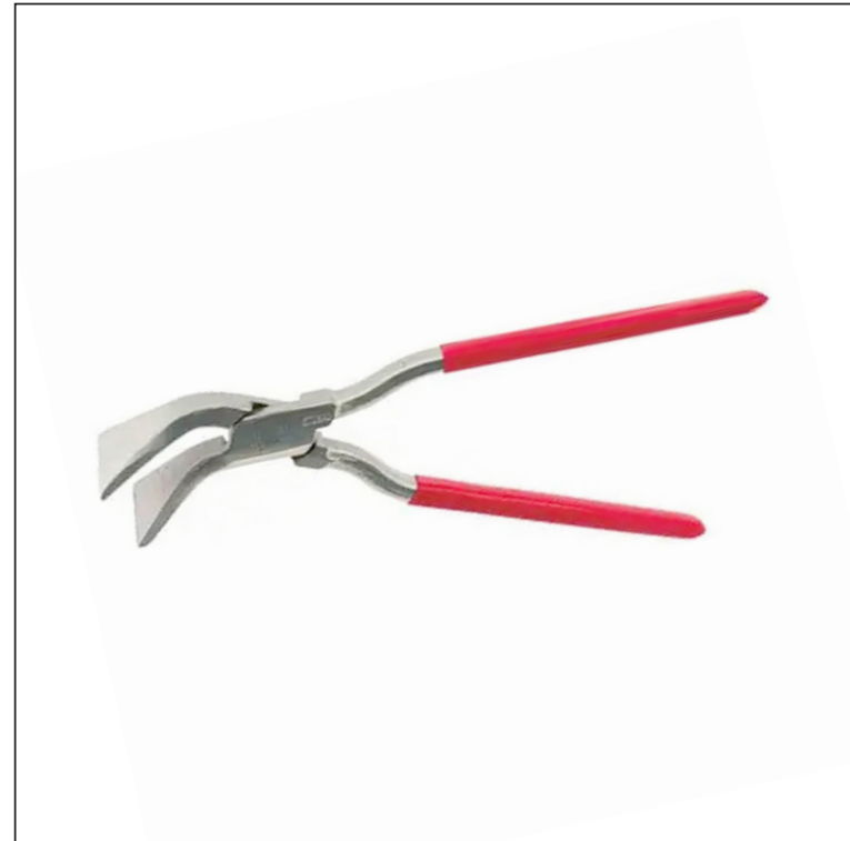
Carbon steel C45