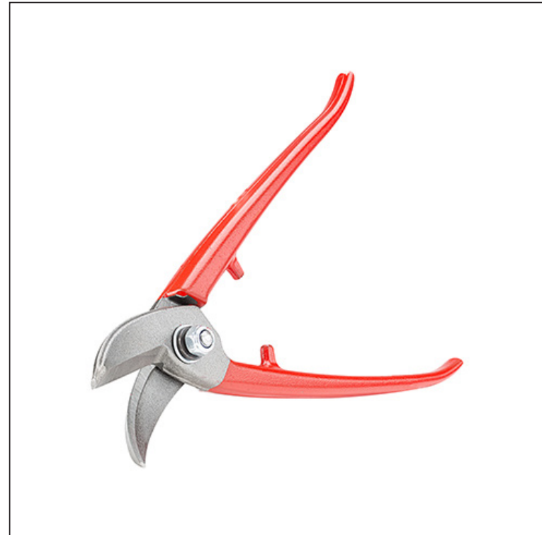
Carbon steel C60