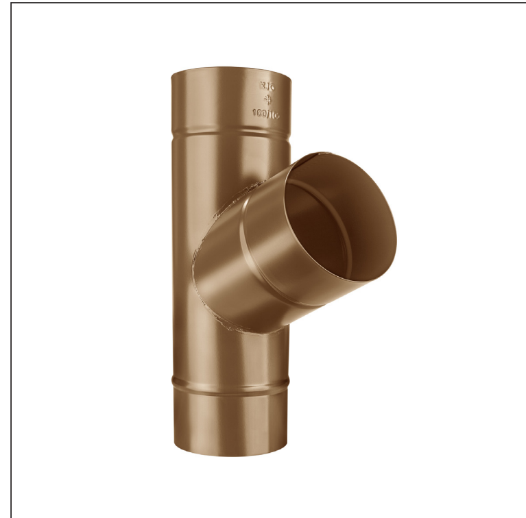
MM Downpipe connector – Metallic copper – RAL extra