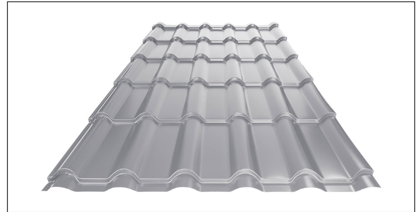
L – OPTIMAL LENGTH OF ROOFING FOR MODULE 350 mm